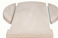
CBO-750 Hearth Insert