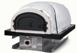
CBO-750 Hybrid Bundle

The 750 model features a larger cooking surface. The hearth now comes in three pieces for easier installation. For quick-heating convenience, we offer a 750 Hybrid model with a two-burner gas system. It can also be used as a wood-burning oven.