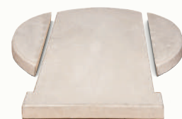
CBO-1000 Hearth Insert

Our new 1000 model offers an even larger cooking surface for professional chefs and outdoor cooking enthusiasts who want to go big. The two-piece dome makes assembly a breeze.